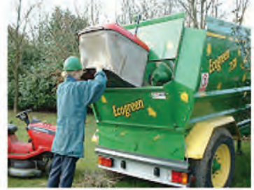
7 cubic metres machine being manually loaded from the rear