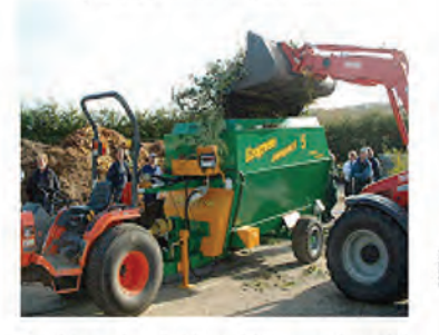
5 cubic metres lightweight compact model