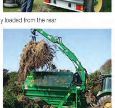
9 cubic metres machine with crane